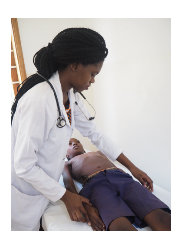
A collaboration between